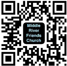
Middle River Friends Website

Thank You! Your MRFC Stewardship Team and Church Ministry Board.